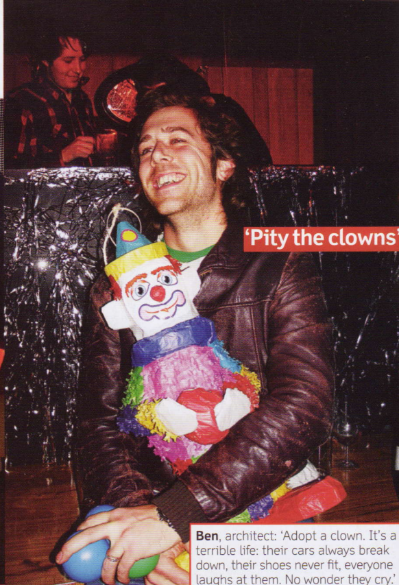
'Pity the clowns'