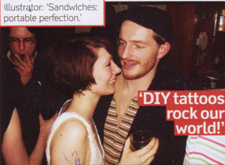
'DIY tattoos rock our world!'